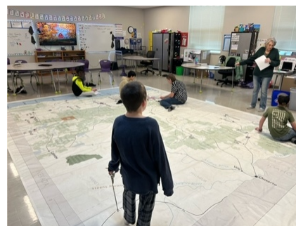
Jefferson Middle School students learning on the Oregon giant map