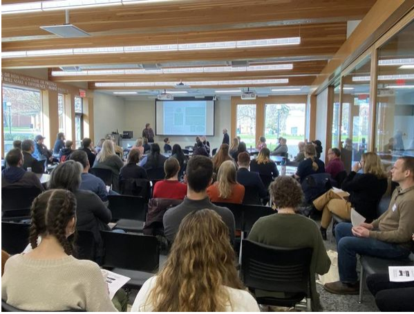
GeoFest Attendees at the keynote address