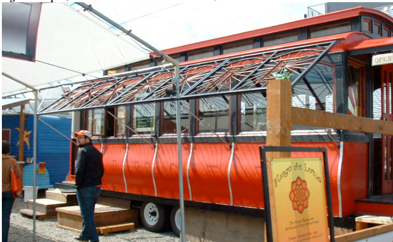
Figure 1 Inspire, a new food cart on NE Alberta and 23rd

Why then, have budding chefs been attracted to food carts? Why do people follow them on social networking sites like Facebook and Twitter, and take visitors to see them? Property managers and real estate developers might ask whether food carts are unsightly, rogue street vendors or potential seeds of urban renewal in a way analogous to the role that artists have played in opening blighted neighborhoods to more upscale development.