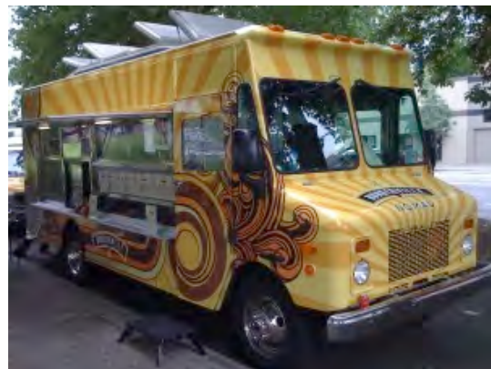
Figure 3. Burgerville's "Nomad"

From an urban design perspective, food carts enrich the urban environment by increasing foot traffic, activating parking lots and streetscapes. There has been some comparison of the food cart movement to the beginnings of the microbrewery industry. However, food carts are not likely to become an export commodity the way local microbrews have. They do provide jobs and income largely to the local community, as opposed to sending profits to corporate chains, although Burgerville 1 has jumped onto the food cart fad recently with its Nomad food truck, and as the