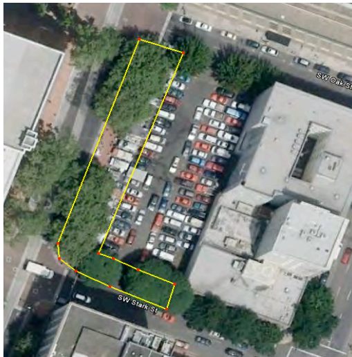
Figure 5. Food cart pod at SW 5th and Stark to Oak between 9th and 10th.