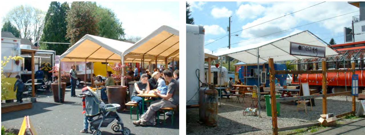
Figure 10. Mississippi Marketplace and Area 23

Food carts are expected to provide seating for four to eight people, besides the additional seating provided by the developer in a covered common area in the middle of the carts. Capturing the community space mentality, “vendors will be asked to use recyclable serving containers, utilize local food sources where possible, recycle trash and compost or donate left-over food to Food Bank programs”. Trash service is pro-rated and shared among the vendors. A covered seating area in the middle of the space lends itself to social interaction. The marketplace also has over 20 artisan, craft or farmer booth spaces, either 8 feet 8 feet or 10 feet by 10 feet available for rent on a daily or monthly basis, none of which were in operation when I visited. Daily rates are $20 or $25 per day, based on a model in which the users provide and set up their own tents.