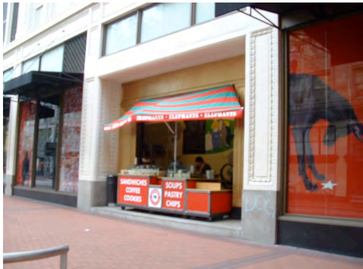
Figure 11. Elephants Deli on SW 5th Ave

Developers should also note the low capital costs of food cart pods as well as the potential to increase the desirability of the tenant mix by rewarding those food carts that reach higher sales levels with longer leases, while canceling those of food carts which do not achieve minimum sales levels, as well as earn a percentage rent by helping to make the pod successful. Such practices, common among retail center developers, reinforce market selection as consumers vote with their dollars.