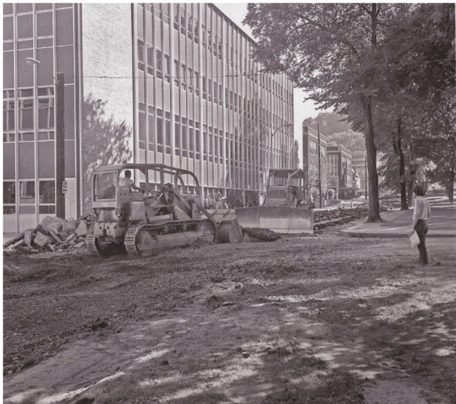
Before: Bulldozers remove pavement in the Park Blocks by College Center (now Smith Memorial Student Union) in 1972.