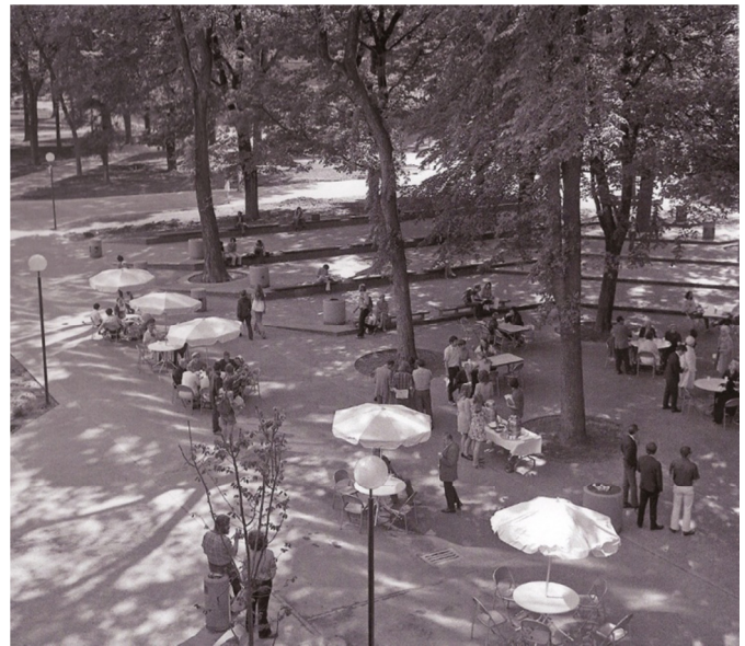
After: With the renovation completed in 1973, walkways and seating areas transform the space opposite present-day Smith Memorial Student Union.

The Park Blocks are an example of a cooperative venture between Portland and Portland State, with the city owning the property and the University maintaining and controlling its use.