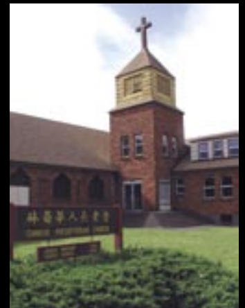
Clockwise, from left: Portland Oregon Temple, LDS, Lake Oswego; St. Stephen's Catholic Church, Portland; Chinese Presbyterian Church, Portland; Apostolic Faith Tabernacle, Portland, and Temple Neveh Shalom, Portland.