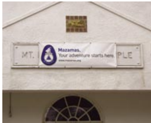
As church attendance has fallen, many church buildings have been converted to other uses. This former church and Masonic lodge in southeast Portland is now home to the Mazamas, a Portland-based mountain climbing organization.

The Portland metro area also is a center for