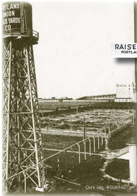
RAISE MORE HOGS PORTLAND UNION STOCK YARDS CO.