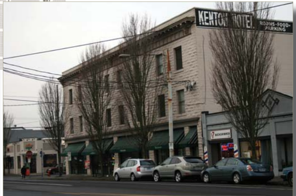
The Masonic Lodge (left) and the Kenton Hotel Building (above) are located on Denver Avenue. The Paul Bunyan statue (Denver Avenue and Interstate), a signature of the neighborhood, was erected for the Oregon centennial exposition in 1959.