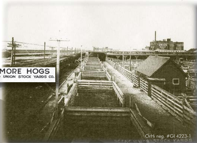
OrHi neg. #G1 4223-1