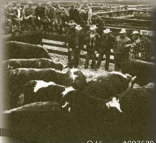
OrHi neg. #007580