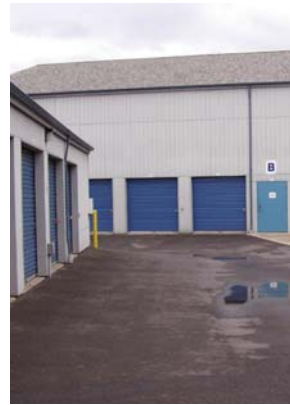
Parkrose Mini Storage.

three-mile radius of the facility where they store. Kevin Howard’s surveys indicate that 70% of his customers live within one mile of the storage facility they patronize. This accounts for a lot of difference in clientele from facility to facility. Whereas storage facilities in Cascade Park in Clark County are doing an increased business in RV storage, facilities such as Portland Storage on Southeast Morrison are seeing an increased business in homeless clientele. With some storage facilities providing units as small as foot lockers, self-storage is often the only choice other than a shopping cart for someone who is homeless. And it is safer for property and well-being. Portland police can ticket the homeless for using shopping carts to transport their possessions, or someone could have all he owns stolen from an unattended