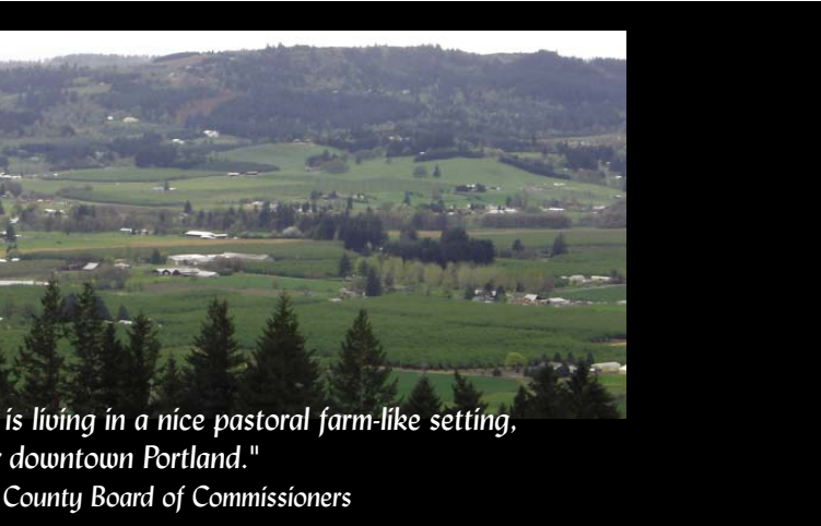
is living in a nice pastoral farm-like setting, downtown Portland." County Board of Commissioners