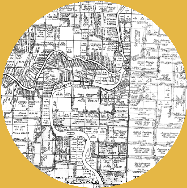
Cadastral map in the Champog area, circa 1860.

the land,” he said. “We must respect another truism: that unlimited and unregulated growth leads inexorably to a lowered quality of life.” Later that year, the legislature adopted Senate Bill 100, which called for a state-wide system to preserve farms and forest land in Oregon. For some, it marked the conception of an iconic land use system that has protected our state’s environment for future generations. For others, it was the beginning of a government bureaucracy whose creeping restrictions continue to threaten American ideals of freedom and private property.