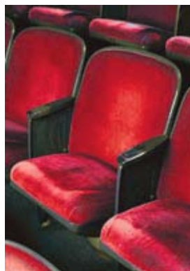
Artwork is representational