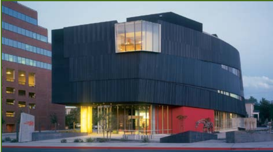
Nevada Museum of Art, will bruder+PARTNERS

A two part installation, the exterior piece emerges from a critical mapping of the terrace and then capturing the spatial understanding with line-work. The interior piece is a study in movement along a line. Both are three-dimensional works comprised primarily of wire, rope, and thread that possess a delicate sketch-like quality. Please join us for an Artists' Talk, Friday October 23rd at 4:00 pm, Shattuck Hall Annex