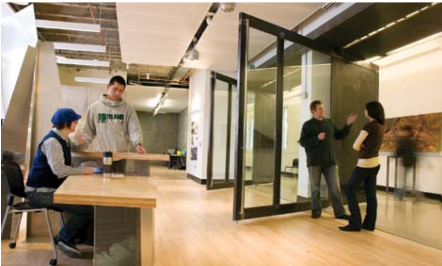
The School of Fine and Performing Arts proudly welcomes its first students to our new Masters of Architecture program!