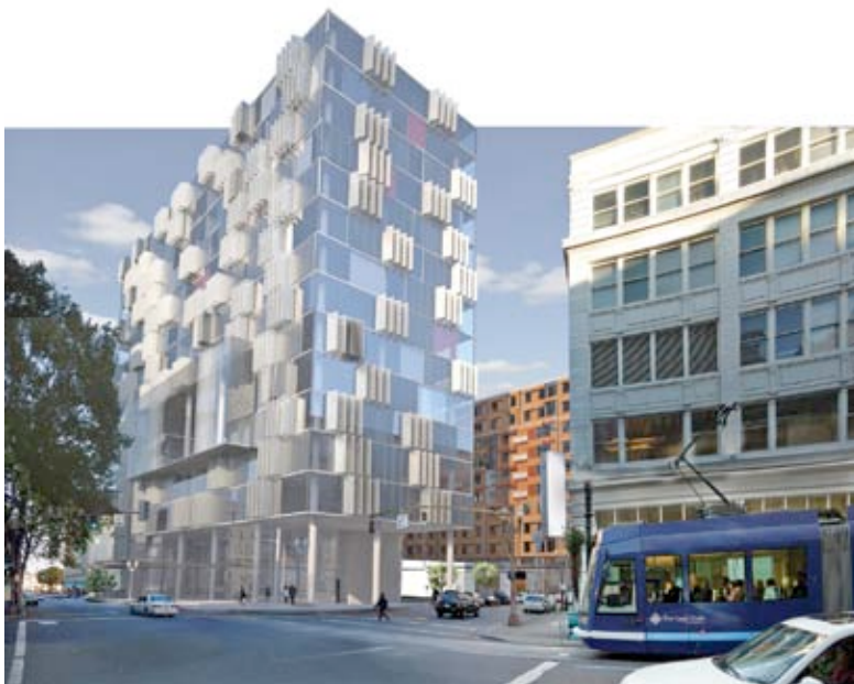
Student work from Will Bruder's Fall Term undergraduate studio, mixed use intervention in downtown Portland.