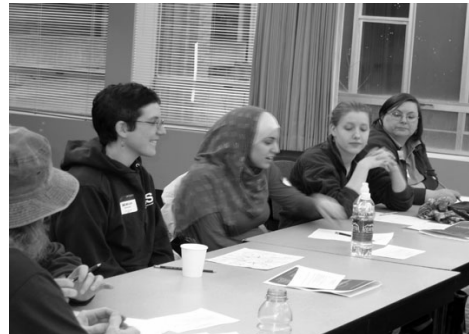
Students engaged in a discussion at the 5th Annual Student Leadership Conference, 1/26/2007.