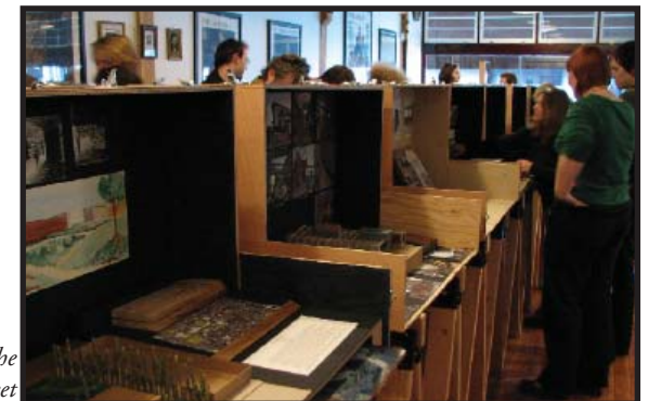
Presenting design ideas to the community of SE Stark Street