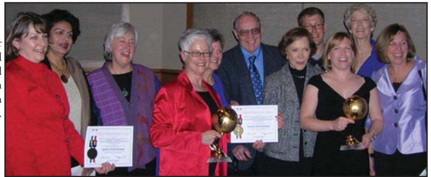
Rosalynn Carter presented the award at PSU's annual Simon Benson Award Dinner in April 09.

The Jimmy and Rosalynn Carter Partnership Award for Campus-Community Partnerships (JRCPA) showcases examples of campus-community partnerships with academic departments and interdisciplinary teams that leverage the resources of the university for the benefit of both the community and the university and enhance both research and student learning by developing and sustaining reciprocal teaching and/or research partnerships which are foundational to effective community engagement.