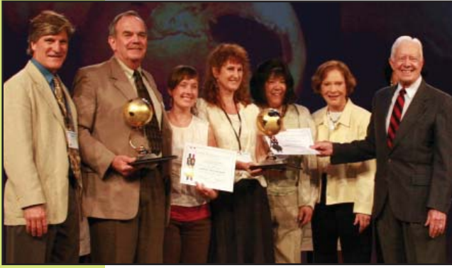
Atlanta GA April 08.